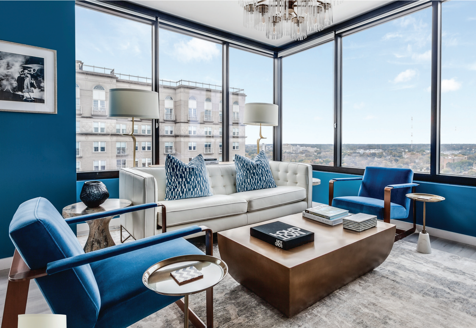
Lamp by Arteriors

This niche offers an opportunity for designers to shine by working with property owners and managers to create customized experiences for their guests. Those who opt for rentals instead of hotels are usually discerning guests with high standards and high expectations.