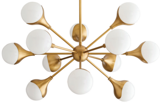
Chandelier by Arteriors