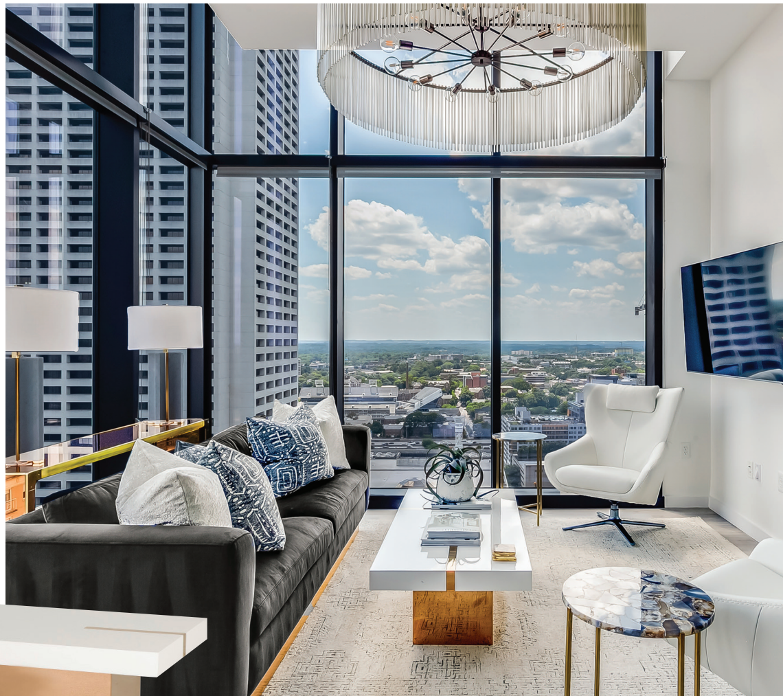
Coffee Table by Resource Decor

DESIGNER DETAILS SET LUXURY RENTAL PROPERTIES APART