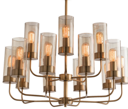
Chandelier by Arteriors